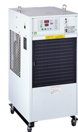
Lubrication oil chiller