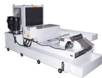
Auto paper strip filter with magnetic separator and coolant system + Tank cooling unit