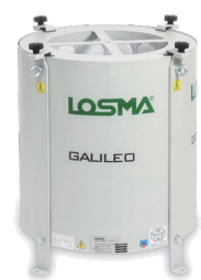
Oil mist collector