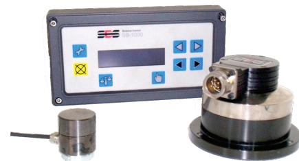
SBS On line wheel balance system -Auto (OPT)