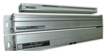
Y-axis vertical / X-axis horizontal Digital readout (FAGOR / HEIDENHAIN)