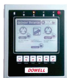
On line wheel balance system -manual